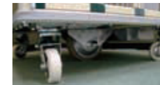
With Electric Motor