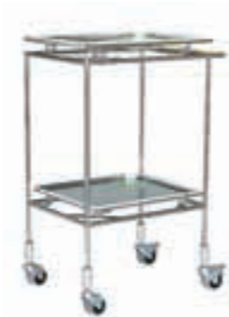
BC-S (with Shock absorbing socket)