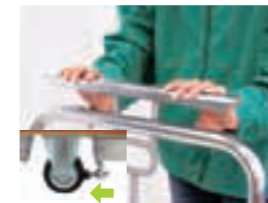
Wheels are locked when lever is released.