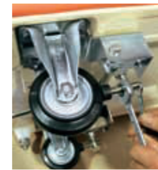
*When you find the stopper device doesn't work adequately, you can adjust such device easily.