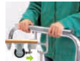
Grip handle and lever gently to deactivate stopper.