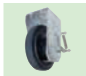
Rear caster: Fixed with stopper type