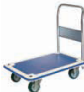
MB (C) -UW (Option)