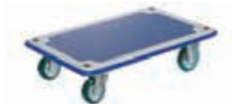
SR (C) -UW (Option)