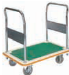
MC (B) - AI (Option)