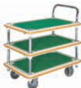
MG (B) - AI (Option)

*Balance the load properly on each shelf.