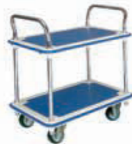
MF (C) - UW (Option)

*Balance the load properly on each shelf.